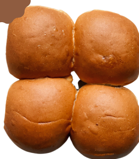
WHITE HAMBURGER, 8/PK 1267

INGREDIENTS: Unbleached unbromated white flour, sugar, sea salt, yeast, unrefined corn oil, malt, whole eggs, filtered water