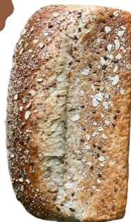
MULTIGRAIN PAN 1117

INGREDIENTS: Unbleached unbromated wheat flour, organic millet seed, organic flax seed, spelt berries, oat, cracked wheat, organic cornmeal, sunflower seeds, sea salt, yeast, wildflower honey, unrefined corn oil, filtered water