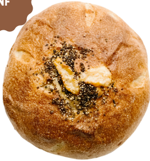
PARMESAN PEPPER 1096

INGREDIENTS: Unbleached unbromated wheat flour, filtered water, Italian Reggiano parmesan, whole wheat flour, tellicherry black pepper, sea salt