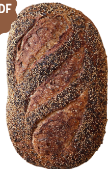
SPROUTED SPELT DELI 1002

INGREDIENTS: Unbleached unbromated wheat flour, coarse whole wheat flour, raw wheat germ, sprouted spelt berries, sea salt, filtered water, organic millet, organic flax seed