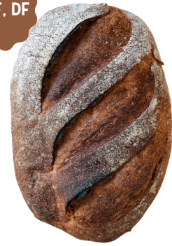
RED FIFE DELI 1023

INGREDIENTS: Mediterra red fife whole wheat flour, raw wheat germ, sea salt, filtered water