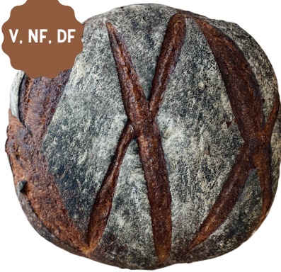
MT. ATHOS 5# 1124

INGREDIENTS: Unbleached unbromated wheat flour, whole wheat flour, raw wheat germ, filtered water, sea salt, organic cornmeal