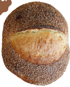
SESAME SEMOLINA 1071

INGREDIENTS: Durum semolina flour, semolina flour, unbleached unbromated wheat flour, filtered water, sesame seeds, sea salt, yeast, organic cornmeal