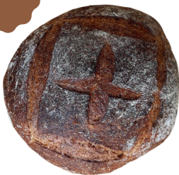
MT. ATHOS FIRE BREAD 1121

INGREDIENTS: Unbleached unbromated wheat flour, whole wheat flour, raw wheat germ, filtered water, sea salt, organic cornmeal