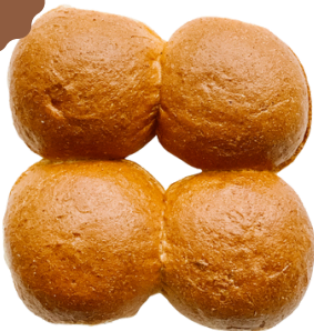
WHEAT HAMBURGER, 8/PK 1291

INGREDIENTS: Unbleached unbromated wheat flour, Mediterra red fife whole wheat flour, sea salt, yeast, unrefined corn oil, sugar, water