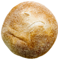
PAESANO, 8OZ. 1081

INGREDIENTS: Unbleached unbromated wheat flour, water, sea salt, yeast, organic cornmeal