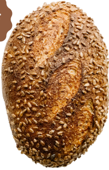
8 GRAIN 3 SEED 1104

INGREDIENTS: Cracked wheat, cornmeal, organic flax seed, organic millet, organic spelt, rye flakes, rolled oats, unbleached unbromated wheat flour, rice flour, buckwheat flour, sunflower seeds, poppy seeds, sea salt, honey, filtered water