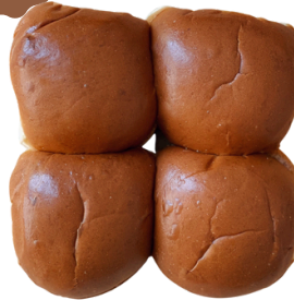
CHALLAH HAMBURGER, 8/PK 1243

INGREDIENTS: Unbleached unbromated wheat flour, filtered water, whole eggs, unrefined corn oil, wildflower honey, sea salt, yeast