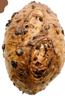
PECAN CRANBERRY 1100

INGREDIENTS: Unbleached unbromated wheat flour, whole wheat flour, filtered water, dried cranberry, toasted pecan, sea salt, organic cornmeal