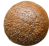
SESAME HAMBURGER, 12/PK 1279

INGREDIENTS: Unbleached unbromated white flour, sugar, sea salt, yeast, unrefined corn oil, malt, whole eggs, filtered water, sesame seeds