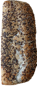
SPROUTED SPELT PULLMAN 1027

INGREDIENTS: Unbleached unbromated wheat flour, coarse whole wheat flour, raw wheat germ, sprouted spelt berries, sea salt, filtered water, organic millet, organic flax seed