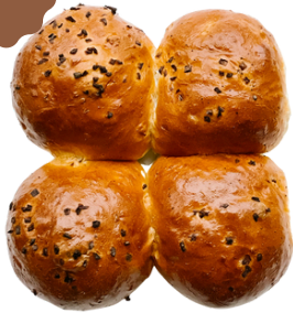
ONION POPPY BUN, 8/PK 1225

INGREDIENTS: Unbleached unbromated wheat flour, sugar, sea salt, yeast, unrefined corn oil, malt, whole eggs, fresh onion, poppy seeds, filtered water