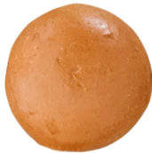
BRIOCHE HAMBURGER, 12/PK 1222

INGREDIENTS: Unbleached unbromated wheat flour, sugar, sea salt, yeast, butter, unrefined corn oil, whole eggs, water