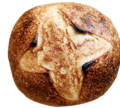
SOURDOUGH, 8OZ. 1044

INGREDIENTS: Unbleached unbromated wheat flour, water, sea salt, yeast