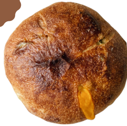
CHILI CHEDDAR 1107

INGREDIENTS: Unbleached unbromated wheat flour, whole wheat flour, filtered water, Vermont sharp cheddar cheese, roasted jalapeño peppers, chili powder, sea salt, organic cornmeal