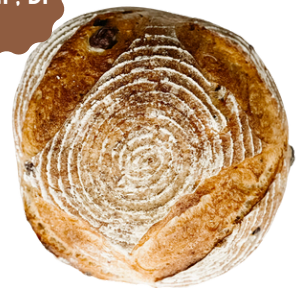
OLIVE FARM 1136

INGREDIENTS: Unbleached unbromated wheat flour, whole wheat flour, filtered water, kalamata olive (may contain pits), sea salt, cornmeal