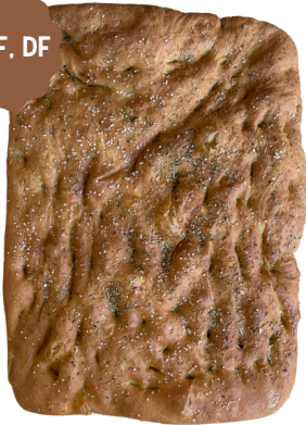
FOCACCIA, ROSEMARY 1455

INGREDIENTS: Unbleached unbromated wheat flour, filtered water, sea salt, yeast, extra virgin olive oil, fresh rosemary