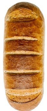
RYE SEEDED DELI 1163

INGREDIENTS: Unbleached unbromated wheat flour, rye flour, filtered water, sea salt, caraway seed (whole & ground), yeast, cornmeal