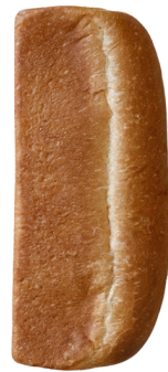
WHITE PULLMAN 1266

INGREDIENTS: Unbleached unbromated wheat flour, sea salt, yeast, unrefined corn oil, sugar, filtered water