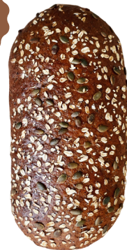
HEARTLAND GRAIN 1115

INGREDIENTS: Unbleached unbromated wheat flour, cracked wheat berries, rye flakes, organic millet, organic flax seed, rolled oats, organic cornmeal, organic spelt, filtered water, wildflower honey, whole wheat flour, pumpkin seed, unrefined canola oil, poppy seed, sea salt, yeast