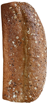
7 GRAIN PULLMAN 1265

INGREDIENTS: Unbleached unbromated wheat flour, sea salt, yeast, unrefined corn oil, sugar, filtered water, cracked wheat, organic cornmeal, organic flax seed, organic millet, organic spelt, rye flakes, rolled oats