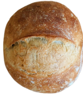
PANE BELLO, 8OZ. 1064

INGREDIENTS: Unbleached unbromated wheat flour, water, sea salt, yeast, organic cornmeal