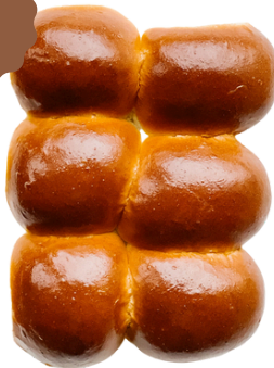
CHALLAH DINNER, 12/PK 1238

INGREDIENTS: Unbleached unbromated wheat flour, filtered water, whole eggs, unrefined corn oil, wildflower honey, sea salt, yeast