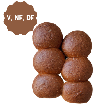
WHEAT, 12/PK 1292

INGREDIENTS: Unbleached unbromated white flour, sugar, sea salt, yeast, unrefined corn oil, malt, whole egg, water, fresh rosemary