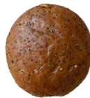
HEARTLAND, 12/PK 1116

INGREDIENTS: Unbleached unbromated wheat flour, cracked wheat berries, rye flakes, organic millet, organic flax seed, rolled oats, cornmeal, organic spelt, filtered water, wildflower honey, whole wheat flour, pumpkin seed, unrefined canola oil, poppy seed, sea salt, yeast