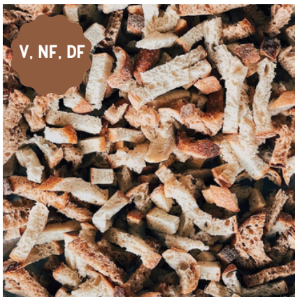
STUFFING CUBES, 2LB. 1503

A cubed assortment of our Farm, Red Fife, and Paesano loaves