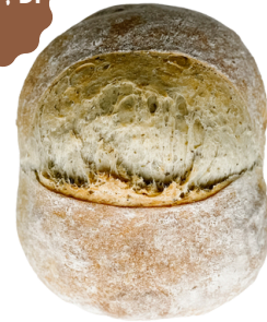
ROSEMARY OLIVE OIL 1132

INGREDIENTS: Unbleached unbromated wheat flour, semolina flour, filtered water, extra virgin olive oil, fresh rosemary, sea salt, yeast, organic cornmeal