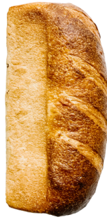
FARM PULLMAN 1057

INGREDIENTS: Unbleached unbromated wheat flour, whole wheat flour, filtered water, sea salt, cornmeal