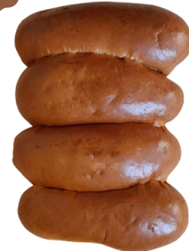
CHALLAH HOTDOG, 8/PK 1242

INGREDIENTS: Unbleached unbromated wheat flour, filtered water, whole eggs, unrefined corn oil, wildflower honey, sea salt, yeast