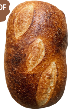
SOURDOUGH DELI 1034

INGREDIENTS: Unbleached unbromated wheat flour, filtered water, sea salt, yeast