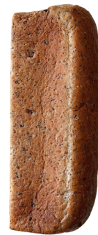
HEARTLAND PULLMAN 1114

INGREDIENTS: Unbleached unbromated wheat flour, cracked wheat berries, rye flakes, organic millet, organic flax seed, rolled oats, organic cornmeal, organic spelt, filtered water, wildflower honey, whole wheat flour, pumpkin seed, unrefined corn oil, poppy seed, sea salt, yeast