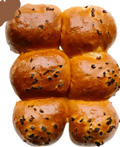
ONION, 12/PK 1223

INGREDIENTS: Unbleached unbromated wheat flour, sugar, sea salt, yeast, unrefined corn oil, malt, whole eggs, fresh onion, poppy seed, water