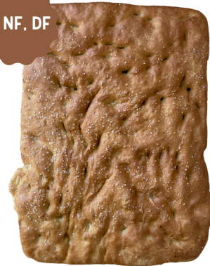
FOCACCIA, SEA SALT 1454

INGREDIENTS: Unbleached unbromated wheat flour, filtered water, sea salt, yeast, extra virgin olive oil