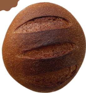
WHOLE WHEAT BOULE 1012

INGREDIENTS: Mediterra proprietary red fife whole wheat flour, unbleached unbromated whole wheat flour, sea salt, yeast, unrefined corn oil, wildflower honey, filtered water