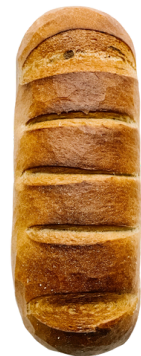
RYE UNSEEDED DELI 1164

INGREDIENTS: Unbleached unbromated wheat flour, rye flour, filtered water, sea salt, ground caraway seed, yeast, cornmeal