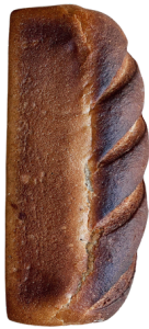
RYE UNSEEDED PULLMAN 1058

INGREDIENTS: Unbleached unbromated wheat flour, rye flour, filtered water, sea salt, ground caraway seed, yeast, cornmeal