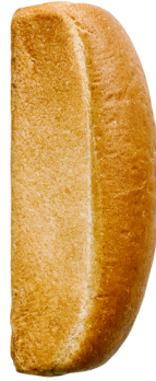
WHEAT PULLMAN 1264

INGREDIENTS: Unbleached unbromated wheat flour, Mediterra red fife whole wheat flour, sea salt, yeast, unrefined corn oil, sugar, filtered water