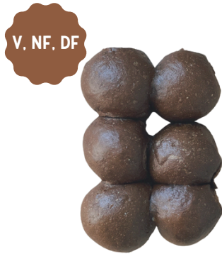
PUMPERNICKEL, 12/PK 1161

INGREDIENTS: Unbleached unbromated wheat flour, rye flour, pumpernickel flour, water, sea salt, caramel, ground caraway seed, yeast, cornmeal