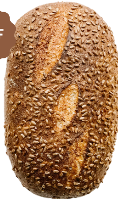
8 GRAIN 3 SEED DELI 1103

INGREDIENTS: Cracked wheat, organic cornmeal, organic flax seed, organic millet, organic spelt, rye flakes, rolled oats, unbleached unbromated wheat flour, rice flour, buckwheat flour, sunflower seeds, poppy seeds, sea salt, honey, filtered water