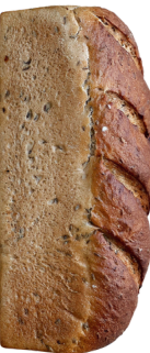
RYE SEEDED PULLMAN 1156

INGREDIENTS: Unbleached unbromated wheat flour, rye flour, filtered water, sea salt, caraway seed (whole & ground), yeast, cornmeal