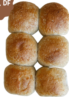
FARM, 12/PK 1055

INGREDIENTS: Unbleached unbromated wheat flour, whole wheat flour, filtered water, sea salt, organic cornmeal