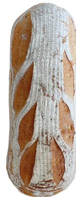
DURUM WHITE 1053

INGREDIENTS: Unbleached unbromated wheat flour, durum flour, sea salt, yeast, unrefined corn oil, filtered water