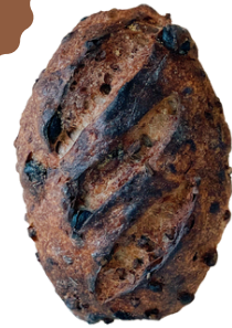
PECAN RAISIN 1090

INGREDIENTS: Unbleached unbromated wheat flour, whole wheat flour, filtered water, dried flame raisin, toasted pecan, sea salt, organic cornmeal