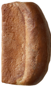
CHALLAH PAN 1230

INGREDIENTS: Unbleached unbromated wheat flour, filtered water, whole eggs, unrefined corn oil, wildflower honey, sea salt, yeast