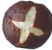
PRETZEL HAMBURGER, 12/PK 1273

INGREDIENTS: Unbleached unbromated wheat flour, milk, sea salt, butter, yeast, brown sugar