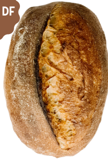
RED FIFE BATARD 1047

INGREDIENTS: Mediterra red fife whole wheat flour, raw wheat germ, sea salt, filtered water