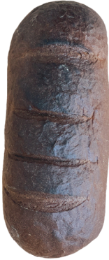
PUMPERNICKEL DELI 1166

INGREDIENTS: Unbleached unbromated wheat flour, rye flour, pumpernickel flour, filtered water, sea salt, caramel, ground caraway seed, yeast, cornmeal