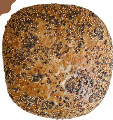
SPROUTED SPELT 1029

INGREDIENTS: Unbleached unbromated wheat flour, coarse whole wheat flour, raw wheat germ, sprouted spelt berry, sea salt, filtered water, organic millet, organic flax seed