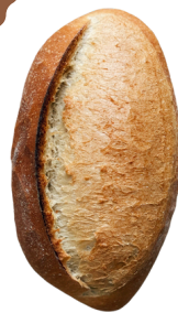
RUSTIC ITALIAN, SMALL 1060

INGREDIENTS: Unbleached unbromated wheat flour, filtered water, sea salt, yeast, organic cornmeal