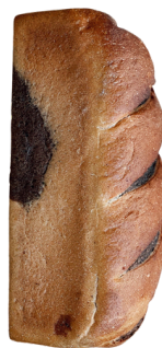
MARBLE RYE PULLMAN 1155

INGREDIENTS: Unbleached unbromated wheat flour, rye flour, pumpernickel flour, filtered water, sea salt, ground caraway seed