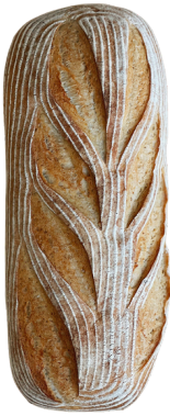
FARM DELI 1056

INGREDIENTS: Unbleached unbromated wheat flour, whole wheat flour, filtered water, sea salt, cornmeal