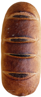
MARBLE RYE DELI 1165

INGREDIENTS: Unbleached unbromated wheat flour, rye flour, pumpernickel flour, filtered water, sea salt, ground caraway seed