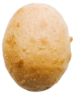
FRENCH, 12/PK 1087

INGREDIENTS: Unbleached unbromated wheat flour, filtered water, sea salt, filtered water, yeast