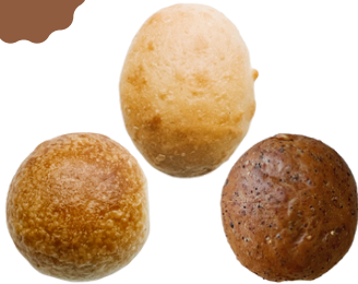
ARTISAN ASSORTMENT, 12/PK 1471

An assortment of our farm roll, french roll, & heartland roll