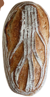
FARM BREAD 1050

INGREDIENTS: Unbleached unbromated wheat flour, whole wheat flour, filtered water, sea salt, organic cornmeal