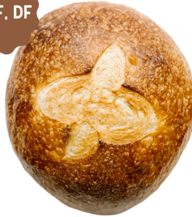
SOURDOUGH ROUND 1040

INGREDIENTS: Unbleached unbromated wheat flour, filtered water, sea salt, yeast