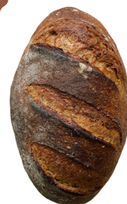
RUSTIC RYE 1167

INGREDIENTS: Unbleached unbromated wheat flour, rye flour, caraway seed