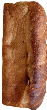
CHILI CHEDDAR PULLMAN 1473

INGREDIENTS: Unbleached unbromated wheat flour, whole wheat flour, filtered water, Vermont sharp cheddar cheese, roasted jalapeño peppers, chili powder, sea salt, cornmeal