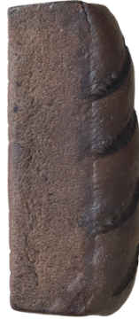
PUMPERNICKEL PULLMAN 1170

INGREDIENTS: Unbleached unbromated wheat flour, rye flour, pumpernickel flour, filtered water, sea salt, caramel, ground caraway seed, yeast, cornmeal