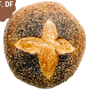
STEEL CITY SOURDOUGH 1045

INGREDIENTS: Unbleached unbromated wheat flour, filtered water, sea salt, yeast; topped with sesame, poppy & fennel seeds