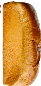
CHALLAH PULLMAN 1226

INGREDIENTS: Unbleached unbromated wheat flour, filtered water, whole eggs, unrefined corn oil, wildflower honey, sea salt, yeast