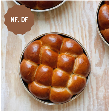
PARKERHOUSE ROLL, 12/PK 1251

INGREDIENTS: Unbleached unbromated wheat flour, sugar, sea salt, yeast, unrefined corn oil, whole egg, pineapple juice, vanilla extract, water