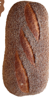
SESAME SEMOLINA DELI 1003

INGREDIENTS: Durum semolina flour, semolina flour, unbleached unbromated wheat flour, filtered water, sesame seeds, sea salt, yeast, cornmeal